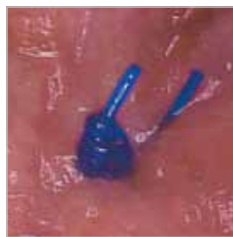
Secure 1 close with a polypropylene monofilament suture