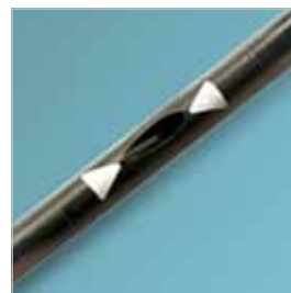
Guide wire exit port allows wire access to be maintained