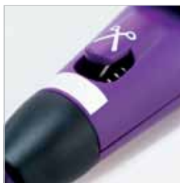
Single operator procedure with QuickCut mechanism