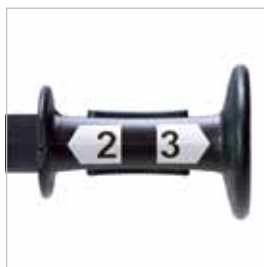
Numbered deployment sequence