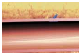
Suture brings the tissues together to promote primary healing – no need for a clot to form to close the arteriotomy